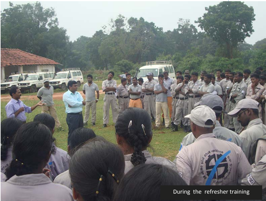
During the refresher training

Following annual staff refresher training in Mulliyaweilei GN Division, Mullaitivu District, hundreds of FSD staff lined up on Saturday 05 th January to donate blood destined for the most vulnerable and war affected community in Northern Sri Lanka. Blood donations are a vital resource to help treat health conditions including cancer and long term illnesses, people involved in accidents and in maternity care.